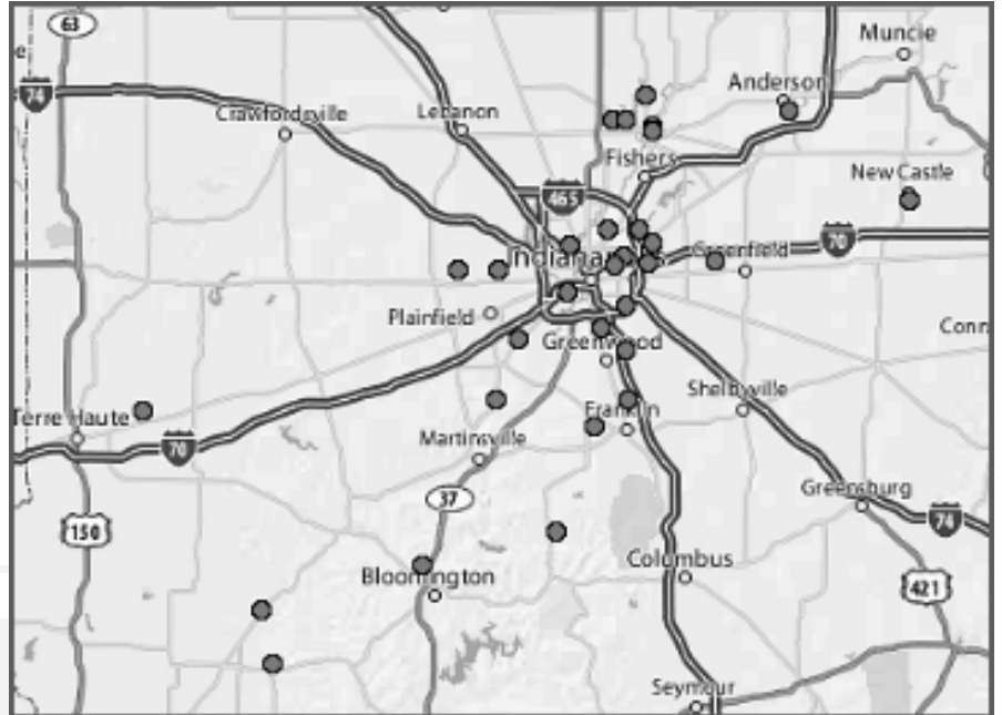
The map above shows the locations of participating clinics.

WHEN: Since all surgeries must be done in February, appointments should be made immediately.